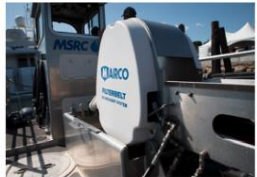
Image 2: MARCO Collecting Grate, Boom and Belt Assembly

In addition to remote and autonomous piloting, SMR automated manually controlled systems such as the boom control, skimming belt, water pump, and tank level monitoring.